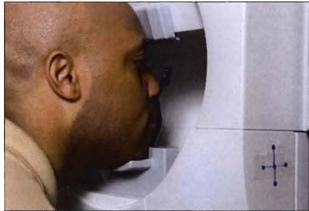
Visual field testing is used to monitor peripheral, or side, vision.

Glaucoma medications can preserve your vision, but they may also produce side effects. You should notify your ophthalmologist if you think you may be experiencing side effects.